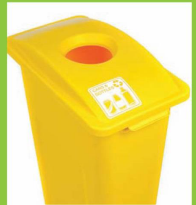
Custom colors available