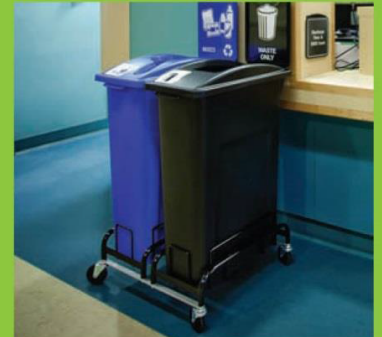
Optional Wheel Dollies