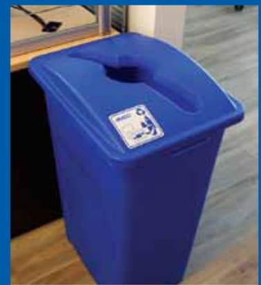
Multiple lids available